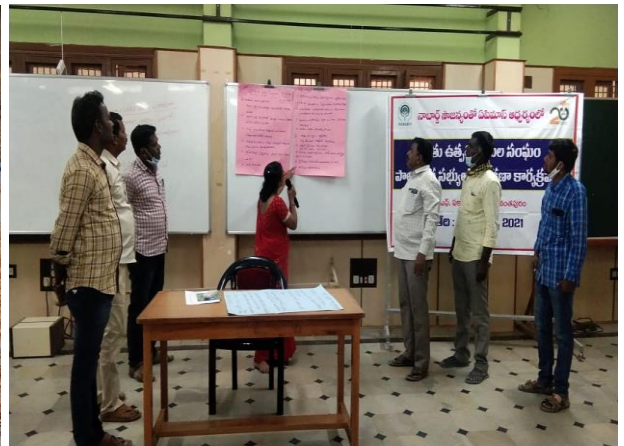
CEOs Training in AF ecology centre