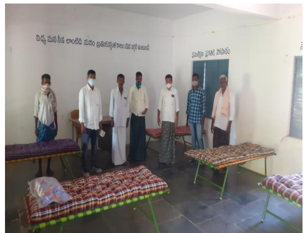
Donate the beds in Kotanka COVID-19 Isolation Centre.