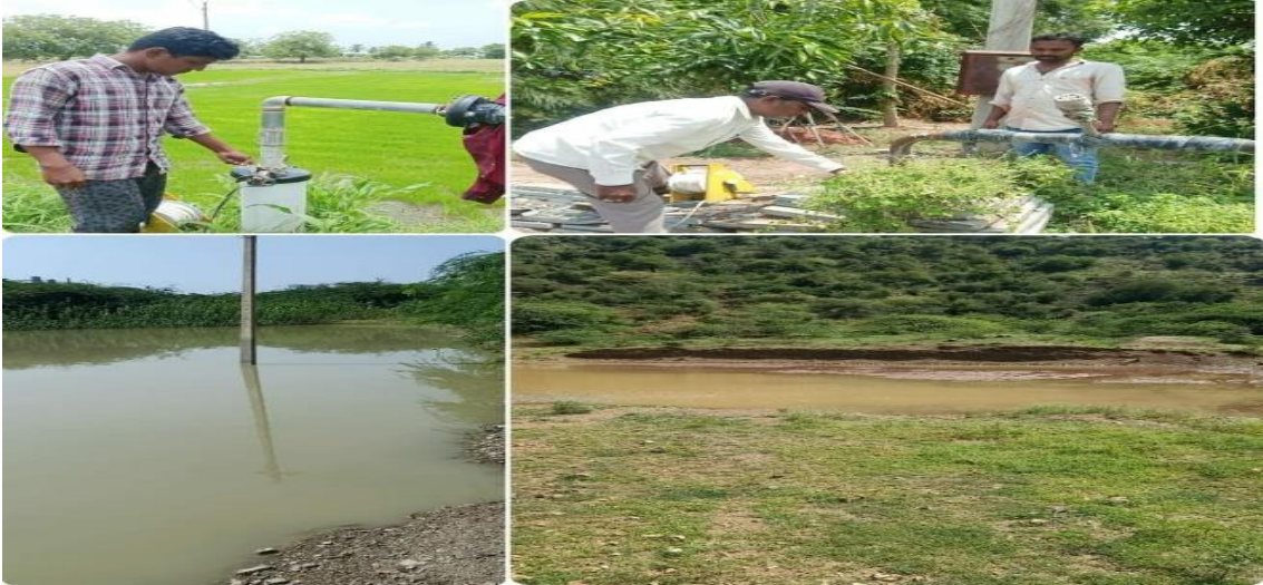
Water level indicator: measure water levels

The most relevant outcome of the ICRISAT Watershed area innovation of agriculture aspects, Natural Resource Management of environmental impacts. It is increasingly used for the process of technical and institutional at the farm level of impact. Technology production increasingly is embedded in innovation systems.