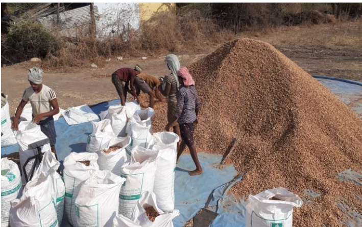
Ground nut Processing in kotanka village

Kallumadi FPO (Kallumadi chennakesava swammy rupss) : The Kallumadi Farmers Producer Organization .Total share holders are 230 members. Equity mobilized Rs.230000, 5 Years business plan prepared submit to APMAS Hyd.the fpo is eligible for BDA 5lakhs.Training in BOD Members and CEO . 30 no Womens Tailaring Training under MEDP NABARD Programme.