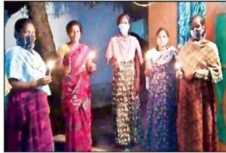
కొవ్వొత్తులతో నివాళులు అర్పిస్తున్న మహిళలు

కళ్యాణదుర్గం, న్యూస్టుడే: HIV తో మృత్యుచెందిన వారి ఆత్మకు శాంతి కలగాలని రిడ్స్ స్వచ్ఛంద సంస్థ సభ్యులు నివాళులు అర్పించారు. ఆదివారం రాత్రి ఎవరి ఇళ్ల వద్ద వారే కొవ్వొత్తులు పట్టుకుని నివాళులు అర్పించారు. బాధిత కుటుంబాలకు ప్రగాఢ సానుభూతిని తెలిపారు. కార్యక్రమంలో ఆయా గ్రామాల్లో ఉన్న రిడ్స్ స్వచ్ఛంద సంస్థ సభ్యులు పాల్గొన్నారు.