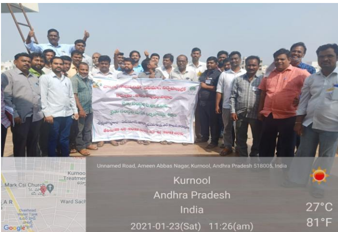
Book keeping Training on CEOs at Karnool